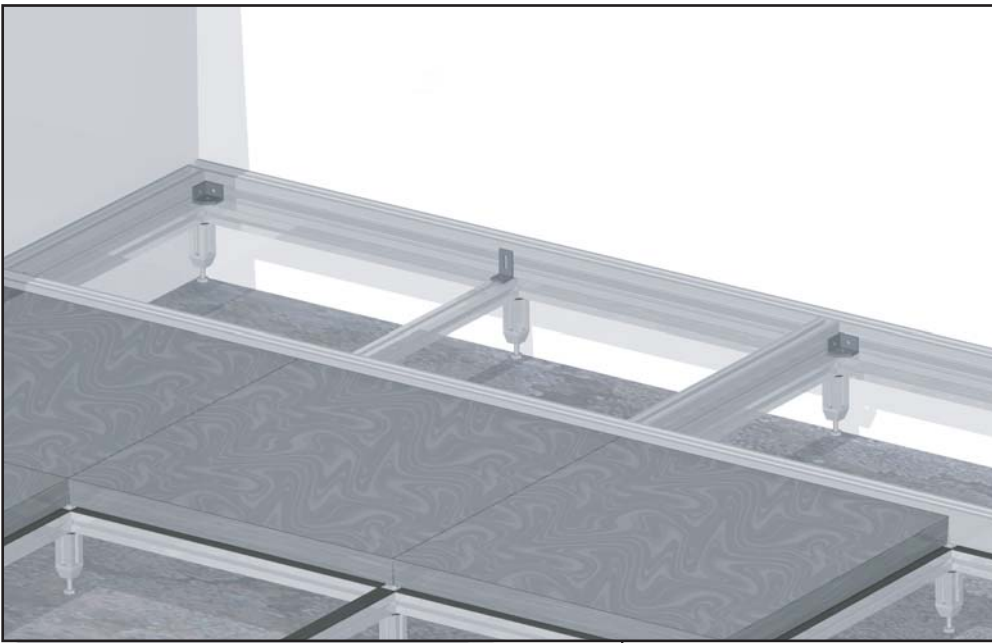
Wisar - Rahmen